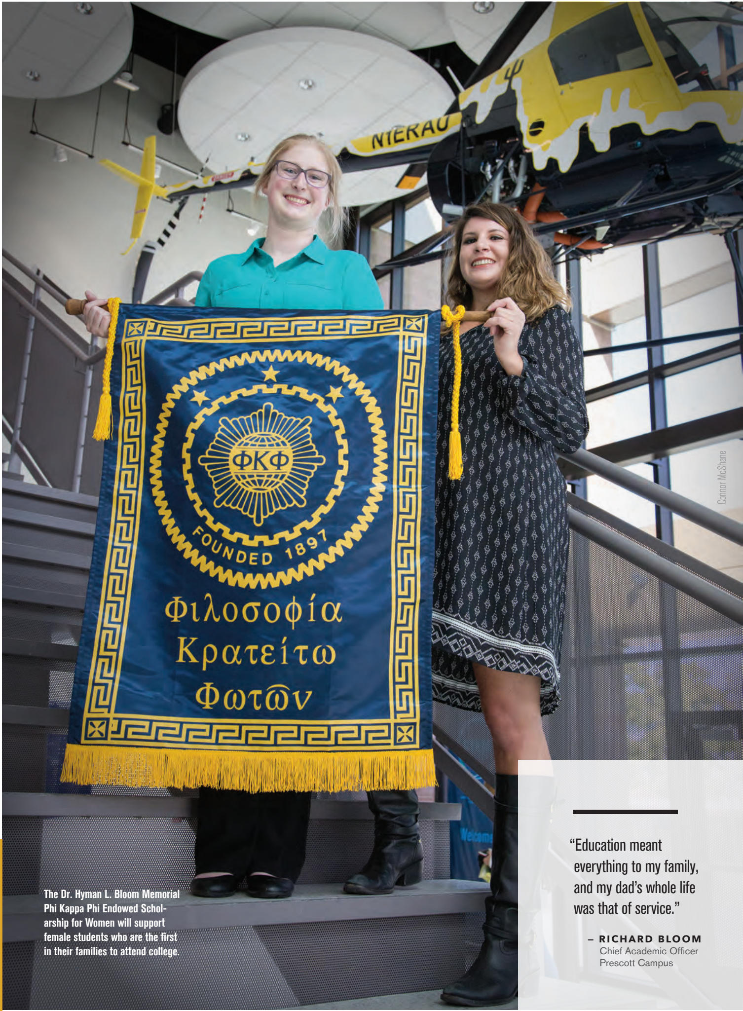
The Dr. Hyman L. Bloom Memorial Phi Kappa Phi Endowed Scholarship for Women will support female students who are the first in their families to attend college.