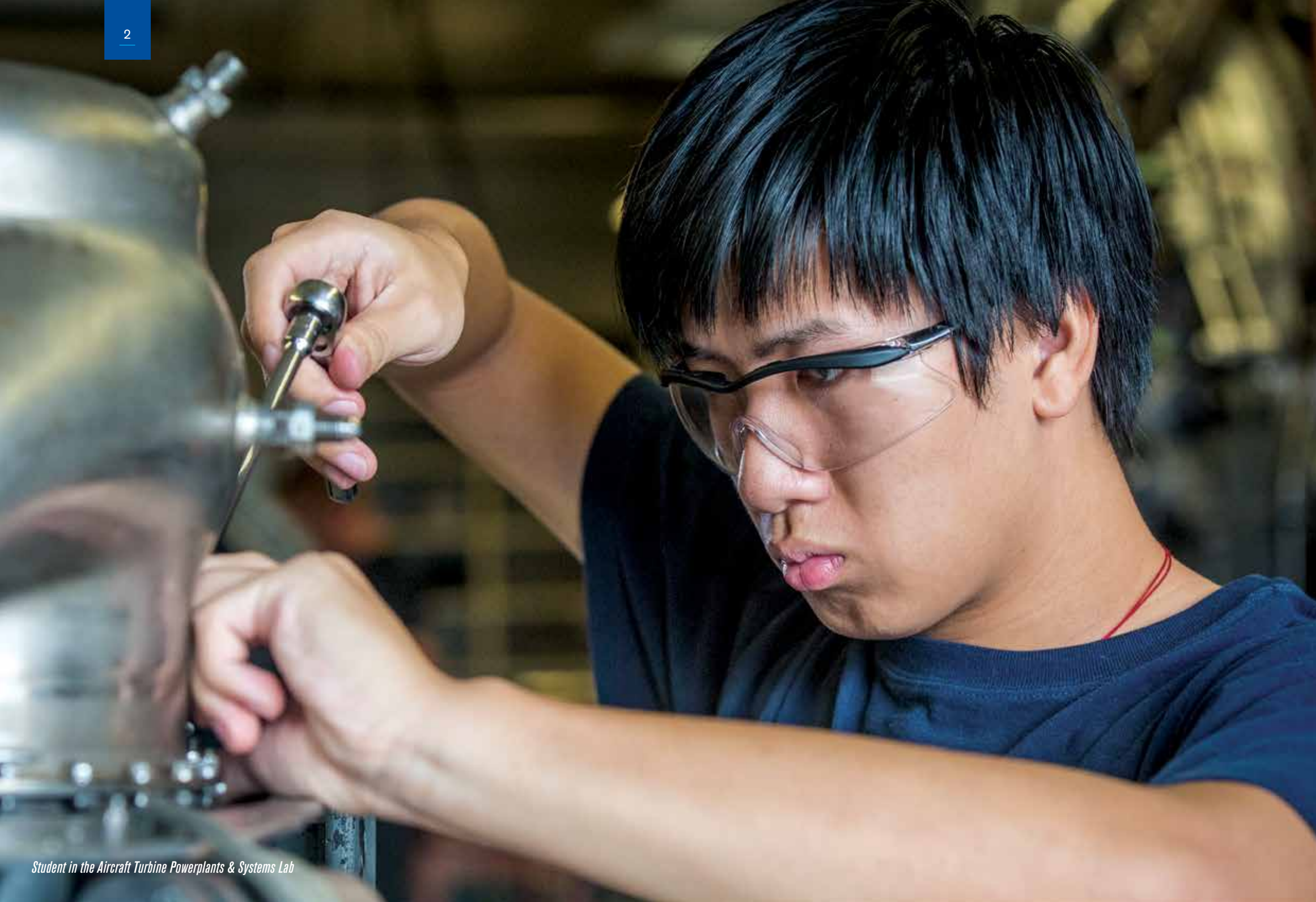
Student in the Aircraft Turbine Powerplants & Systems Lab

At the College of Aviation, we set the standard in high-level quality education demanded by the aviation profession by: