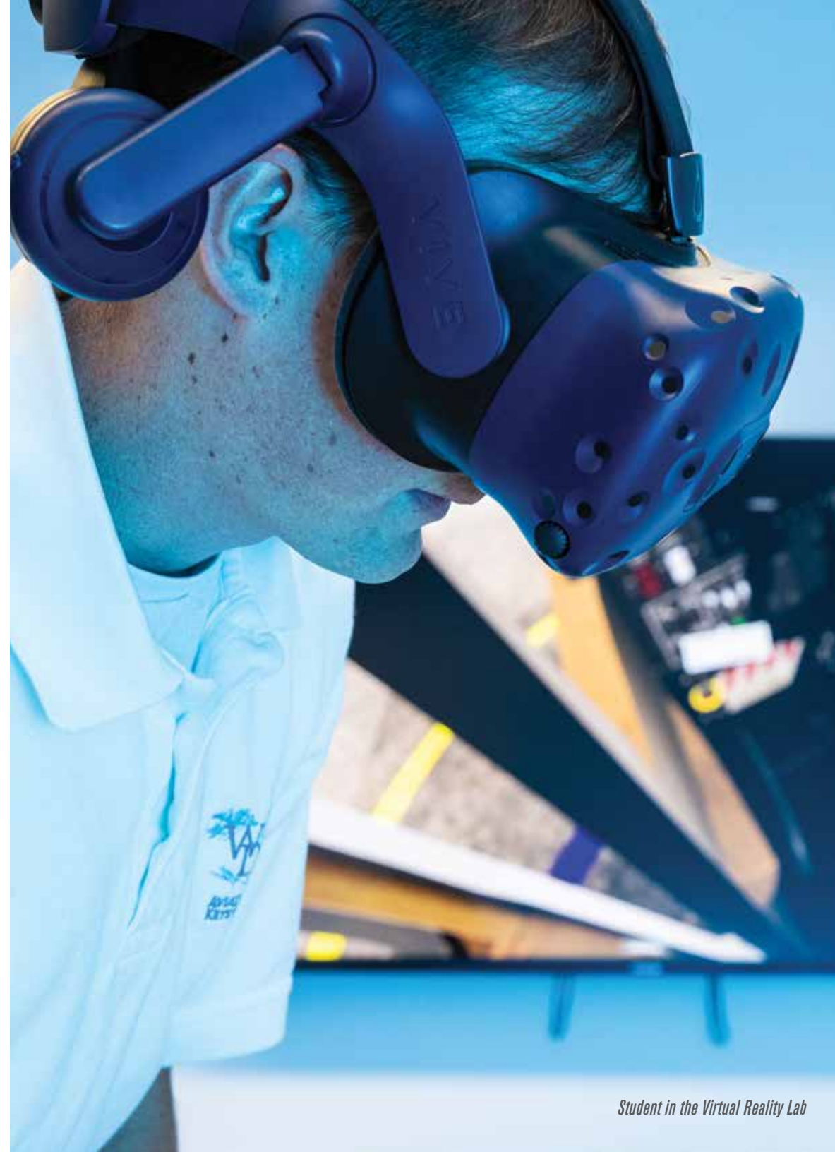
Student in the Virtual Reality Lab

Technology is the engine that drives aviation. To ensure students are prepared for dynamic careers after graduation, they need to interact with the same technology they will find at the cutting edge of aviation and aerospace — the kind of technology we house in our laboratories.